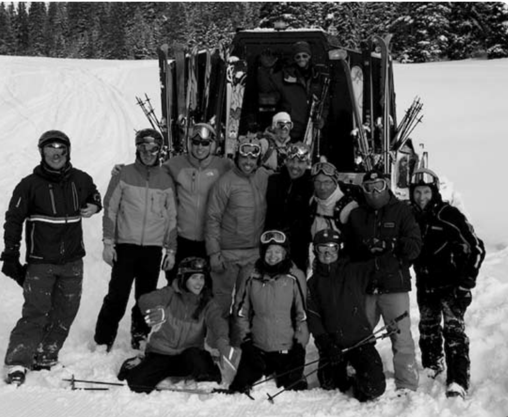
Attendees of 2009 Snowcat Ski Day.